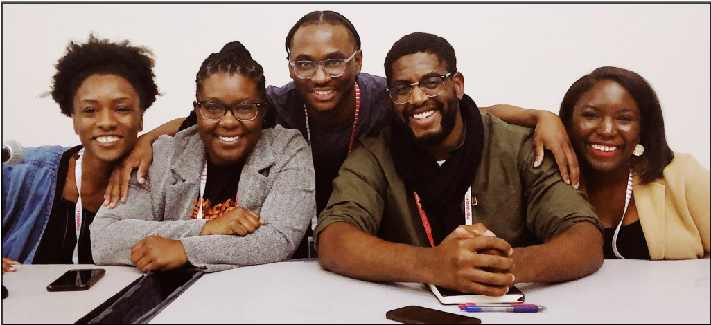
Emerging Professionals Panel