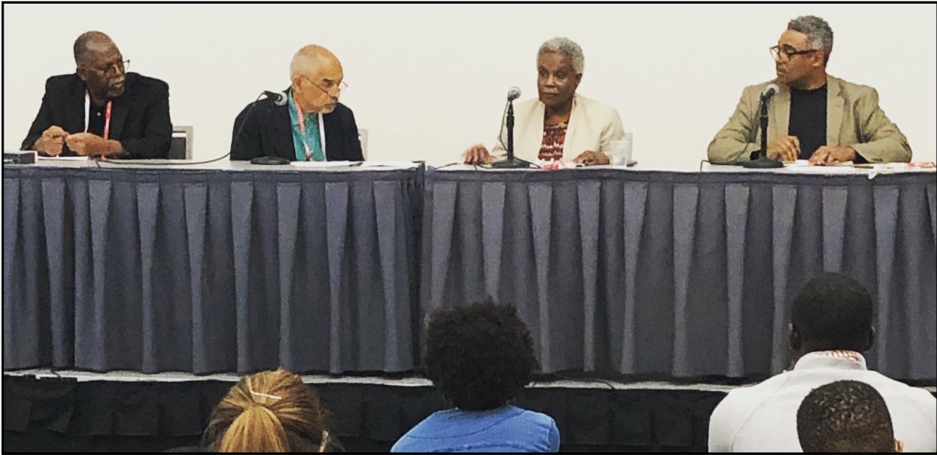
Mentor Professional Panel

The BlackLAN Luncheon was followed by a two-hour Session that was open to all Conference attendees. The two panels included “Mentor Professionals” who discussed the history of the BlackLAN and insights into the experiences of black landscape architects to date. The second panel, “Emerging Professionals,” included a dialogue about professional opportunities, challenges and opportunities as black landscape architects.