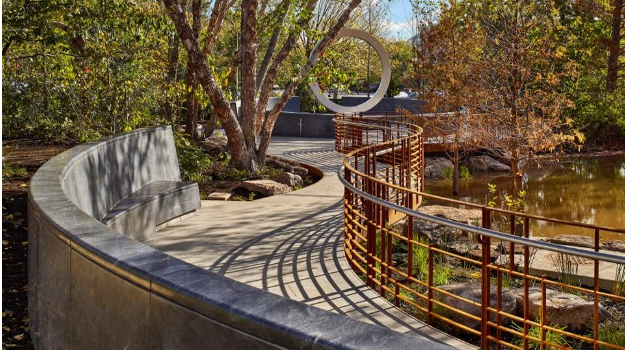
National Native American Veterans Memorial, Washington, DC, by Rhodeside Harwell (RHI)