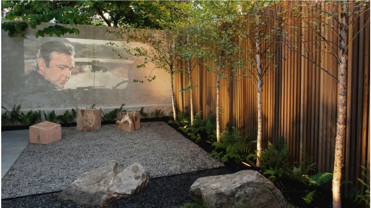
26 East, Annapolis, by LOCH Collective